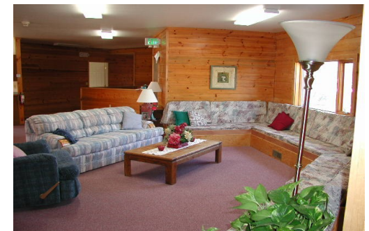
Harbor Lights House Assisted Living, Inc.

Because of our enthusiastic staff and exceptional volunteer program, residents are given daily opportunities for enriching activities that energize the body, stimulate the mind, and refresh the spirit.